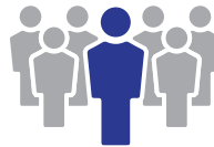
Sirius Employer of Record